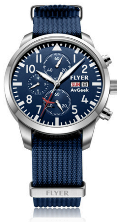
AvGeek® Navy FW-AVG-25-RD