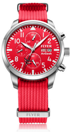
AvGeek® Red FW-AVG-25-RD

The AvGeek® range is engineered for precision and reliability, featuring robust stainless-steel cases, sapphire-coated glass for enhanced scratch resistance, and high-accuracy Miyota quartz movements. Designed for pilots, aviation enthusiasts, and anyone who appreciates quality timepieces, each watch blends aviation-inspired detailing with 100m water resistance, making it perfect for the cockpit, the office, or everyday adventures.