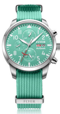
AvGeek® Mint FW-AVG-25-RD