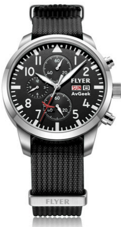
AvGeek® Black FW-AVG-25-RD