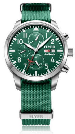
AvGeek® Green FW-AVG-25-RD